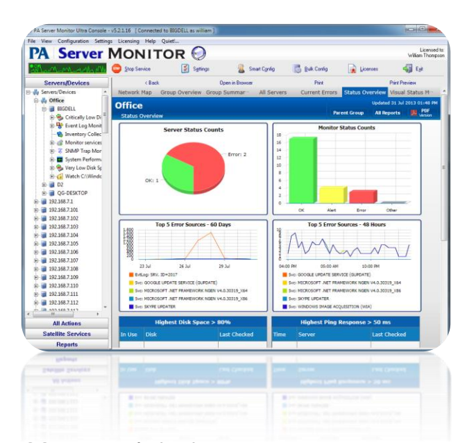
Download a Free 30 Day Trial at